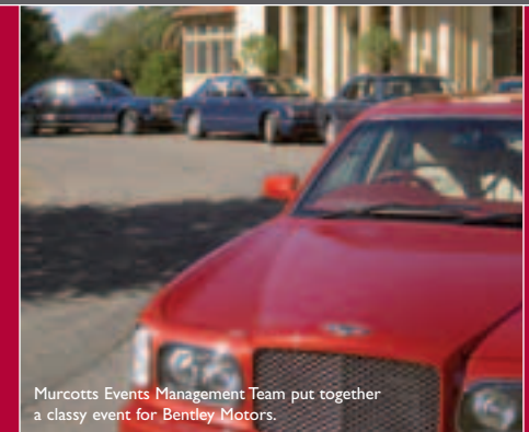
Murcotts Events Management Team put together a classy event for Bentley Motors.