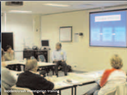
Incident/crash investigation training

"Murcotts made it all happen at short notice and worked above and beyond the call of duty to ensure it ran on time and in the best possible way. We got more than value-for-money."